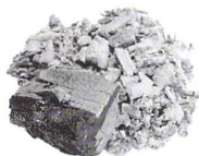
Coals and Ashes