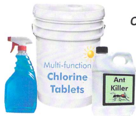
Chemicals, Poisons, and Liquids