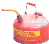
Gasoline and other Fuels